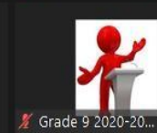
Grade 9 2020-20...